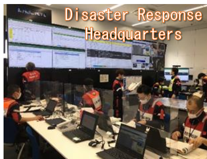
Disaster Response Headquarters