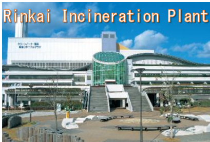
Rinkai Incineration Plant