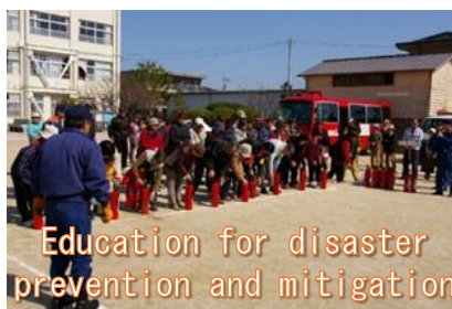
Education for disaster prevention and mitigation

To cope with natural disasters, which are occurring more frequently and intensely in recent years, the city strives to strengthen the functions of the newly established Disaster Response Headquarters by conducting training and workshops with the related departments throughout Fukuoka City. The city also holds evacuation drills and lectures related to disaster management and mitigation, which are popular among its citizens, as well as seminars on fire management of fire and disaster mitigation.