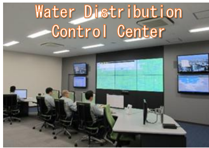
Water Distribution Control Center