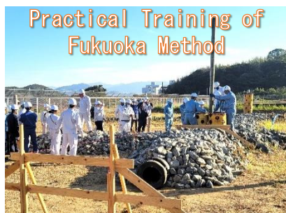
Practical Training of Fukuoka Method