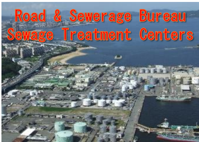
Road & Sewerage Bureau Sewage Treatment Centers