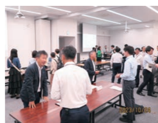
▽ Scene from a matching event

Fukuoka City has a unique system that supports its officials in making a career change to the private sector so that startups in their early stages can secure those with day-one competence. They can return to work for the city within three years of leaving for a startup. This provides a low-risk opportunity for both the startups and the city officials.