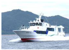
【Kinin - Shikanoshima Route】