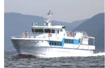
【Midorimaru - Genkajima Route】