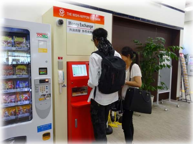
Bottom left and bottom right: Crews exchanging currencies before sightseeing