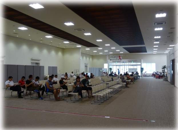
Left: Crews having free Wi-Fi service

Two local major banks also placed machines for foreign currency exchange at the center, offering convenience to not only passengers who go sightseeing but also crew members.