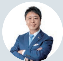
Mayor of Fukuoka City Soichiro Takashima

In May 2014, Fukuoka City was selected as a "Global Startup & Job Creation" for National Strategic Special Zone. (Here after refer as "NSSZ")