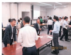
▽ Maching event scene

Fukuoka City has a system to support City employees who want to change jobs to companies, so that startups can secure human resources who can immediately work in the early stages. It is possible for a City employee to return to work in Fukuoka City within three years, which has the advantage of allowing both the City employer and Startup to take on the challenge without an risk.