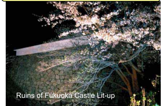
Currently, historic structures and sculptures at 18 different facilities around the city are lit up at night.