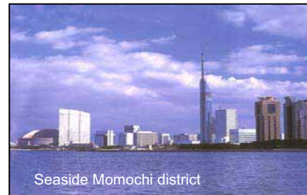
① Momochihama/Jigyohama (Seaside Momochi district) (185.6ha)