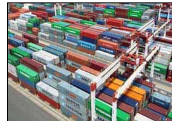
The booming container terminal