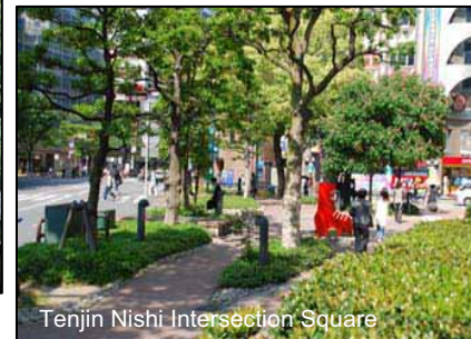
Tenjin Nishi Intersection Square

The open space is lined with original public art creating a comfortable atmosphere.