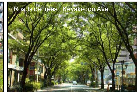
Roadside trees: Keyaki-dori Ave.

The open space is lined with original public art creating a comfortable atmosphere.