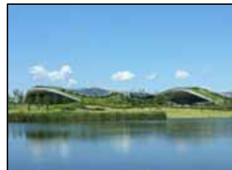
Island City Central Park's "Gurin Gurin"