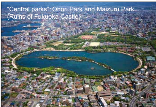
"Central parks": Ohori Park and Maizuru Park (Ruins of Fukuoka Castle)

"Central Parks" are a recreational space in the center of Fukuoka City. The vibrant greenery at the Fukuoka Castle ruins and Ohori Lake's waterside landscape are colorful additions to the city landscape.