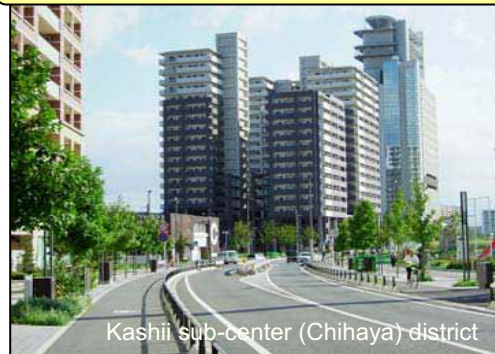
Kashii sub-center (Chihaya) district

A new urban area is being developed in the Kashii/Chihaya district, a sub-center in the eastern part of Fukuoka City.