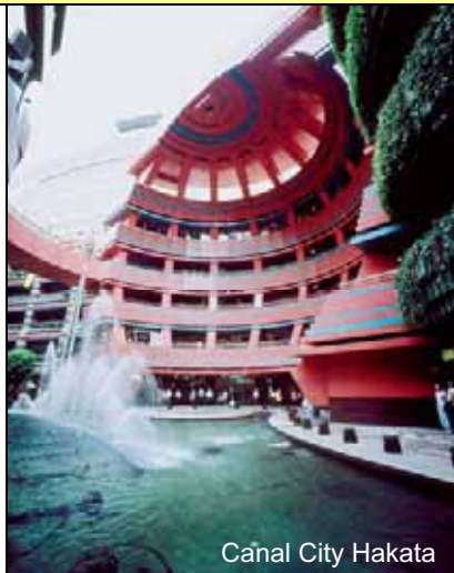
Canal City Hakata

CANAL CITY HAKATA 2009(c)FUKUOKAJISHO WET DESIGN(c)