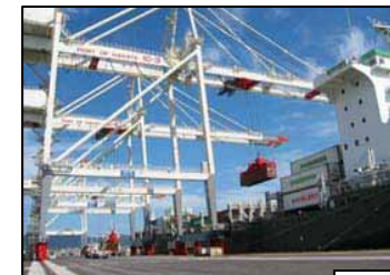
A gantry crane in full operation