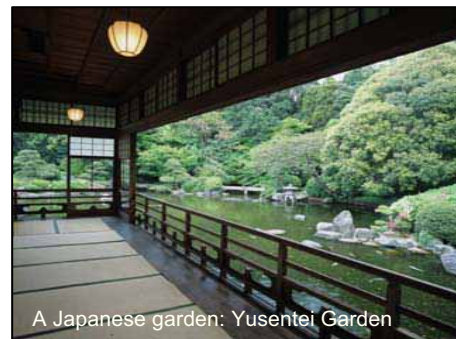
A Japanese garden: Yusentei Garden

Admire the beautiful colors and seasonal changes in one of the most well-known Japanese gardens in Fukuoka City.