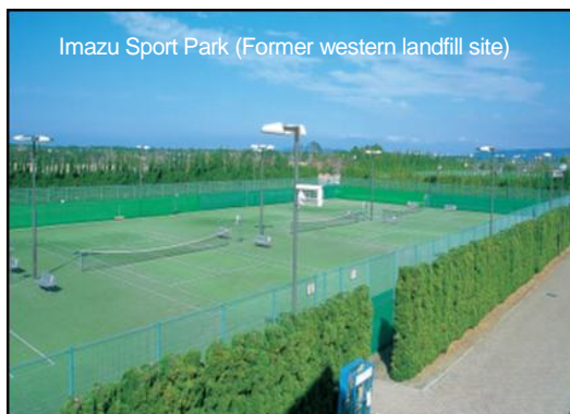
A former landfill site is now a sport park